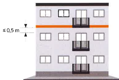
Circumferential fire barrier as an efficient fire barrier in the insulation layer with full balcony integration.

The HIT-HP and HIT-SP elements take over the function of a fire-bolt in the area of the balconies and porches and ensure the prescribed flame- retardancy of the ETICS.